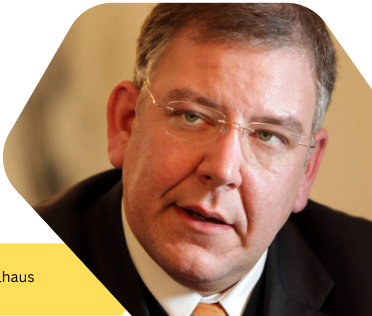
President Mr. Christoph Ahllhaus

President of European Entrepreneurs CEA-PME is Mr. Christoph Ahlhaus since November 2023, and Executive Chairman of BVMW. He also leads as Secretary General the Federal Economic Senate, an exclusive business club of leading Mittelstand entrepreneurs of BVMW, since 2017. From 2008 to 2010 he was Senator (Minister) for the Interior and then in 2010-2011 First Mayor (Prime Minister) of the German City-State Hamburg.